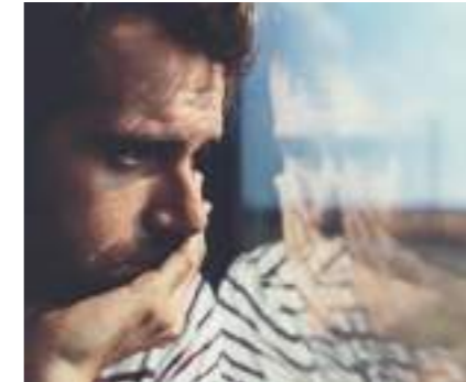
Usually for one person the loss cycle begins, there are 5 stages;

Coming to terms with losing someone who you thought you would be with forever, is one of the most difficult journeys a parent can take.